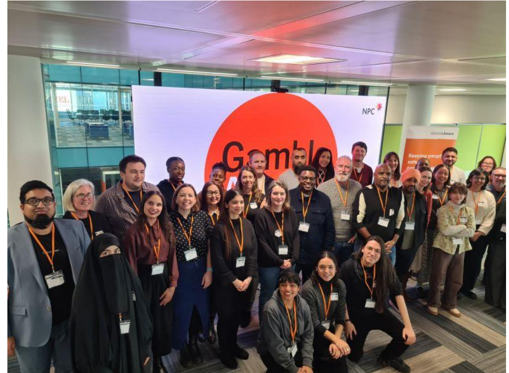
IOF grant-holders at our first learning event, 28 November 2024.

25 18-month grants were awarded in 2024.